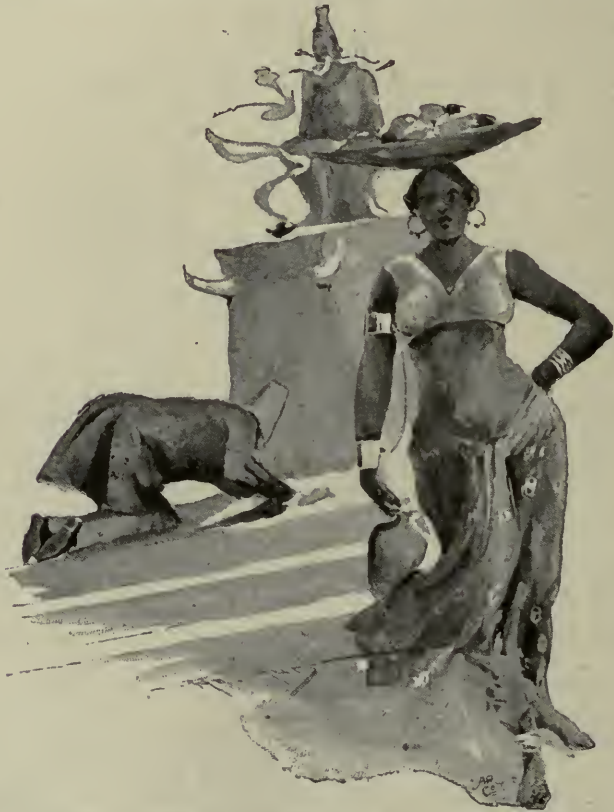
PROBABLY BOWED DOWN TO WOOD AND STONE.